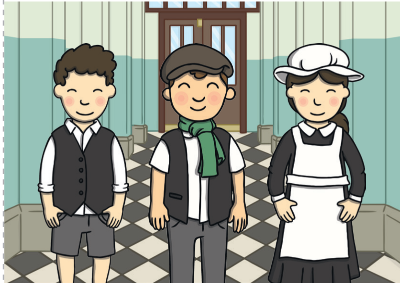
A 'Let's Read Together!' Book