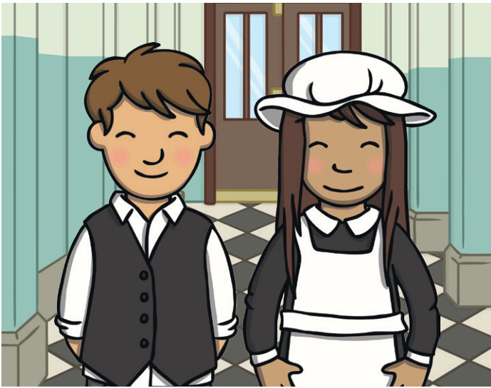
Victorian School Days